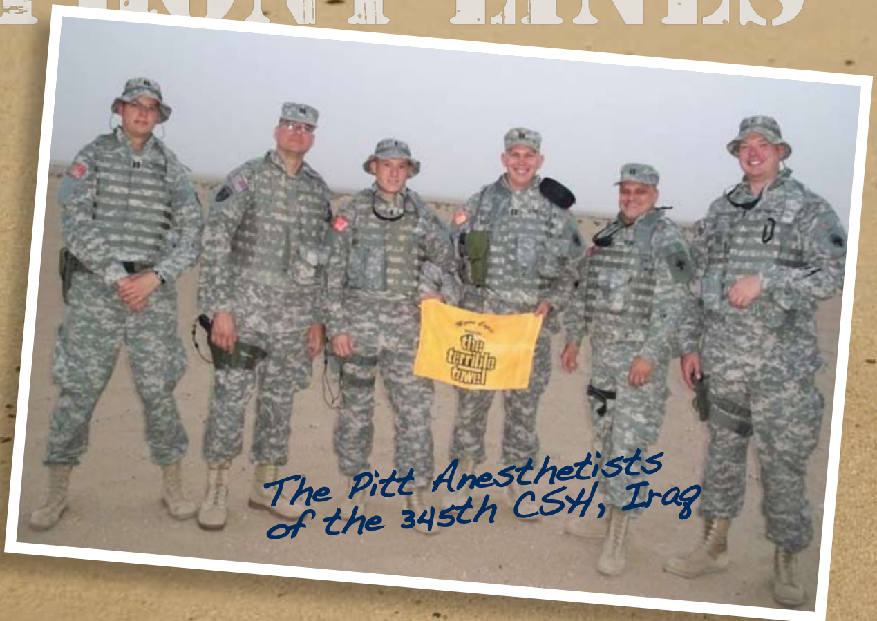
The Pitt Anesthetists of the 345th CSH, Iraq