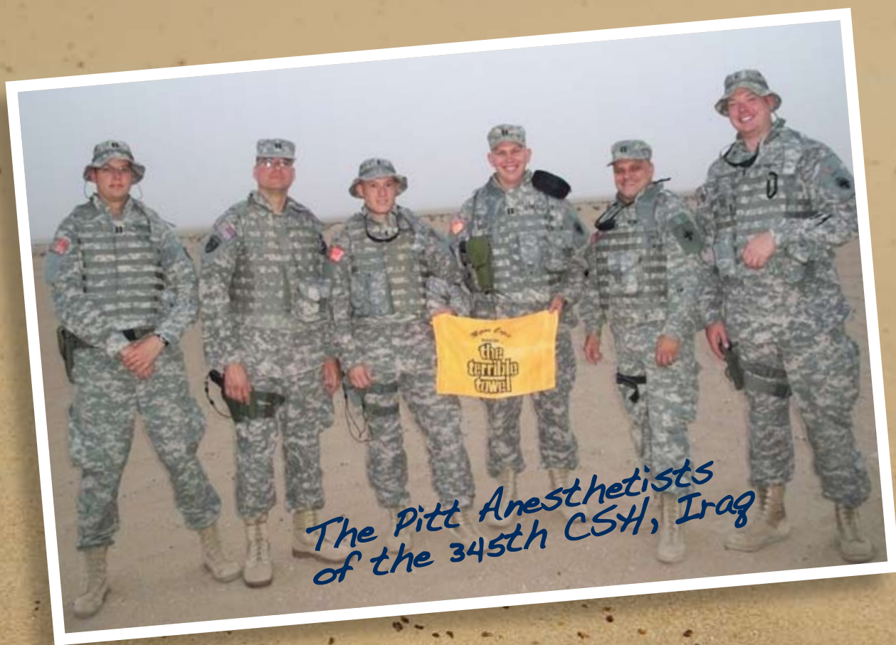
The Pitt Anesthetists of the 345th CSH, Iraq