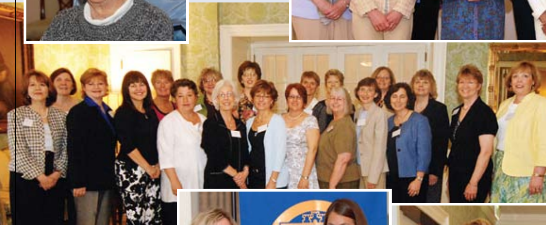
left: The Class of 1978 was the best represented reunion class.